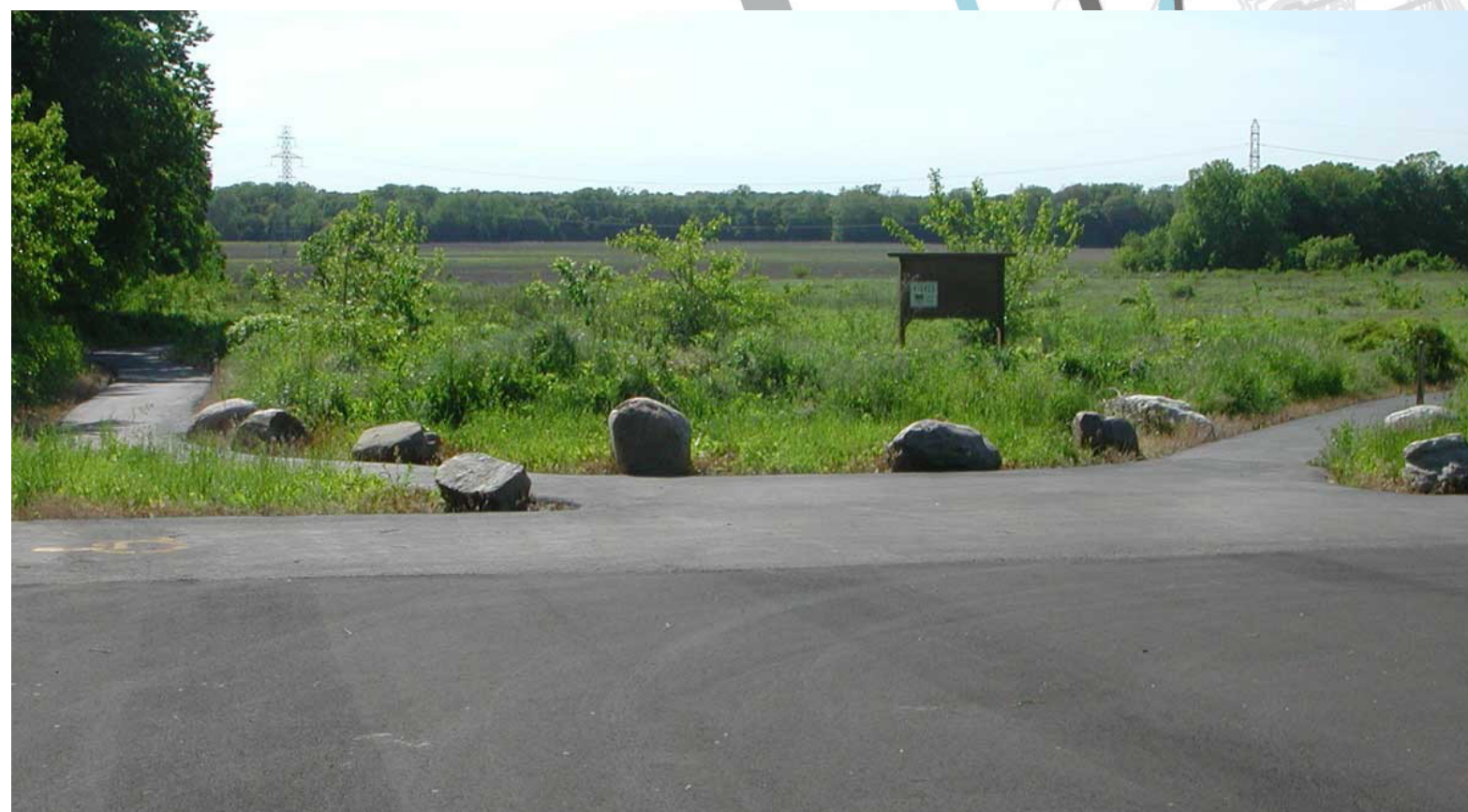
1 PECAN BASIN: CATES-CLAWSON RESERVE