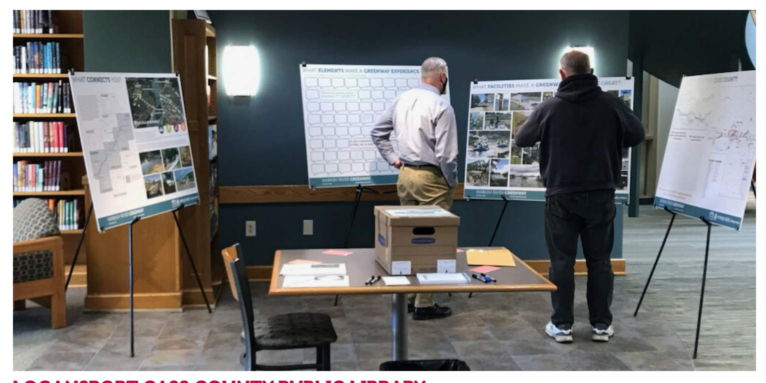
LOGANSPORT CASS COUNTY PUBLIC LIBRARY

Wednesday - Saturday: 11:30am to 2:30pm Sunday - Tuesday: Closed