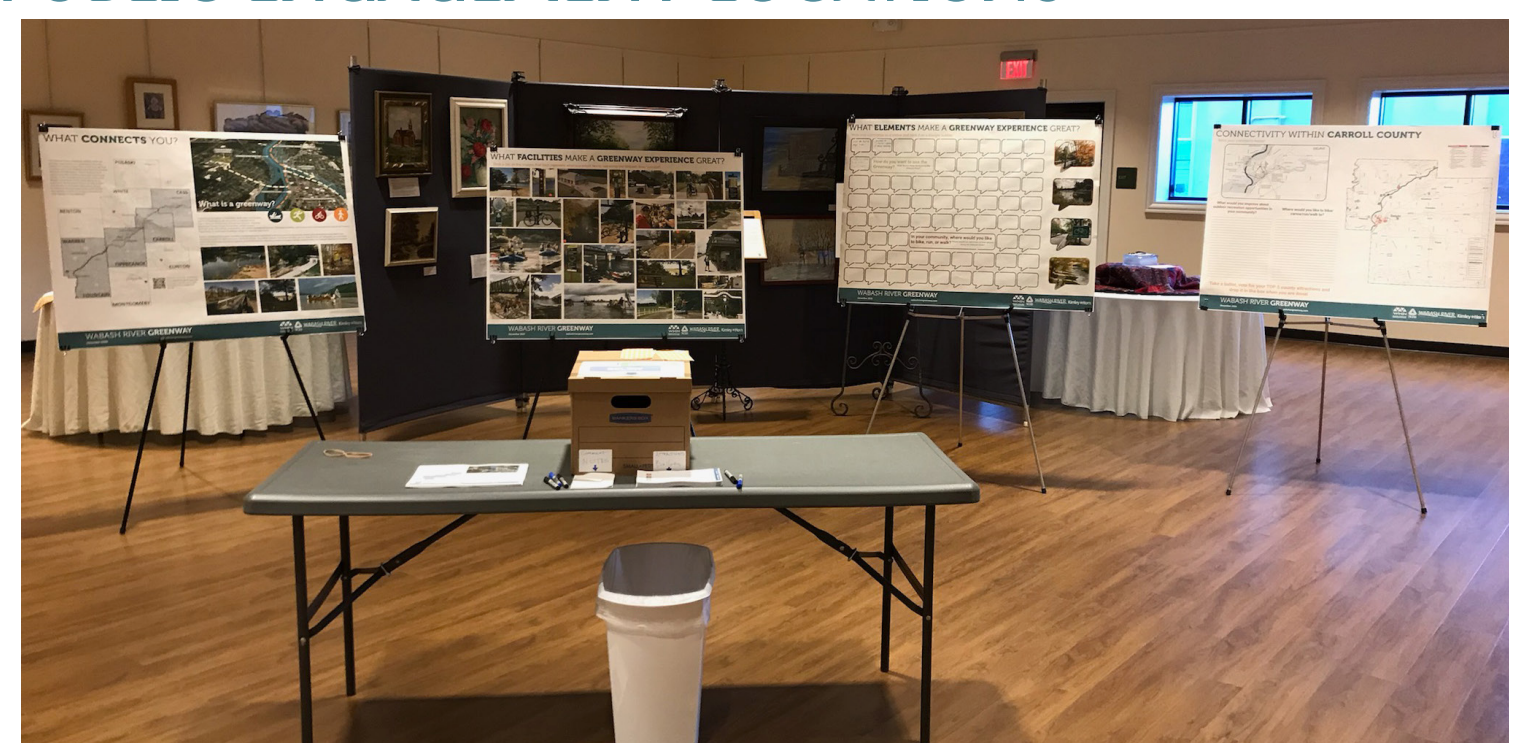
DELPHI OPERA HOUSE

109 S Washington St, Delphi, IN 46923 https://www.delphioperahouse.org