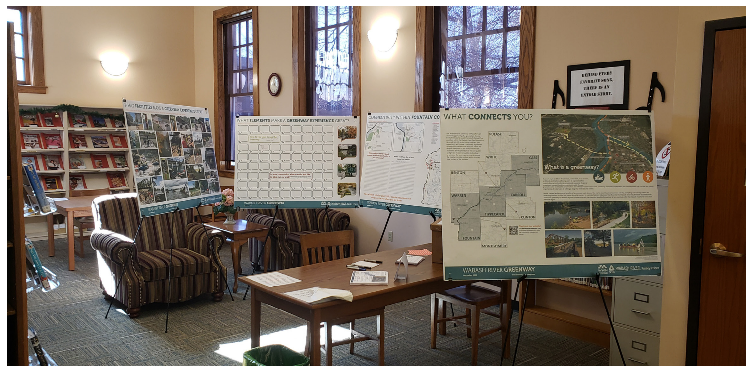
ATTICA LIBRARY 305 S Perry St, Attica, IN 47918 http://attica.lib.in.us

Monday - Friday: 10am to 5pm Saturday: 10am to 2pm Sunday: Closed